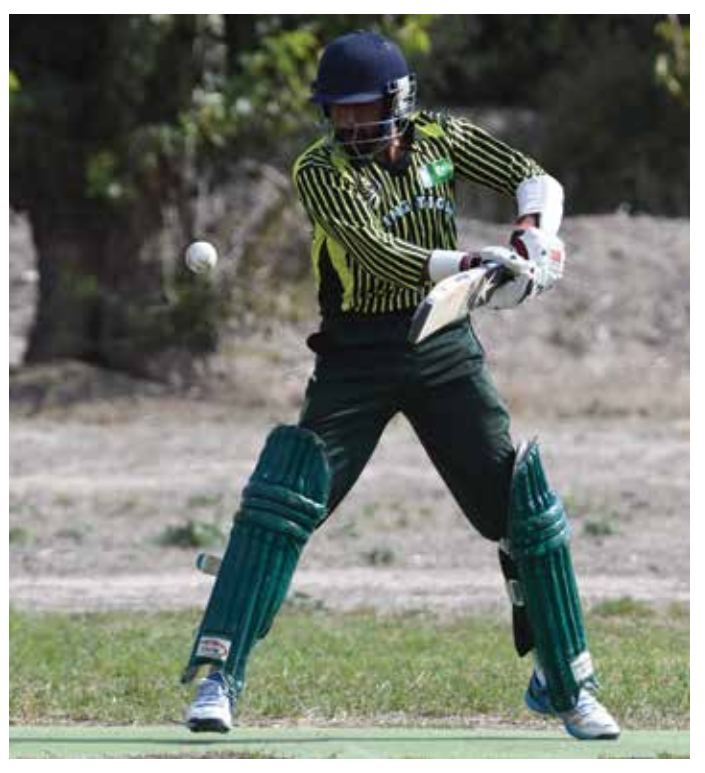
Nicosia Thunders paid dearly for their complacency

that these do not happen again. Also, I have to remind teams to submit fully and correctly completed scoresheets after matches. If you want accurate team and individual statistics, it is up to you all to supply the information to me promptly.