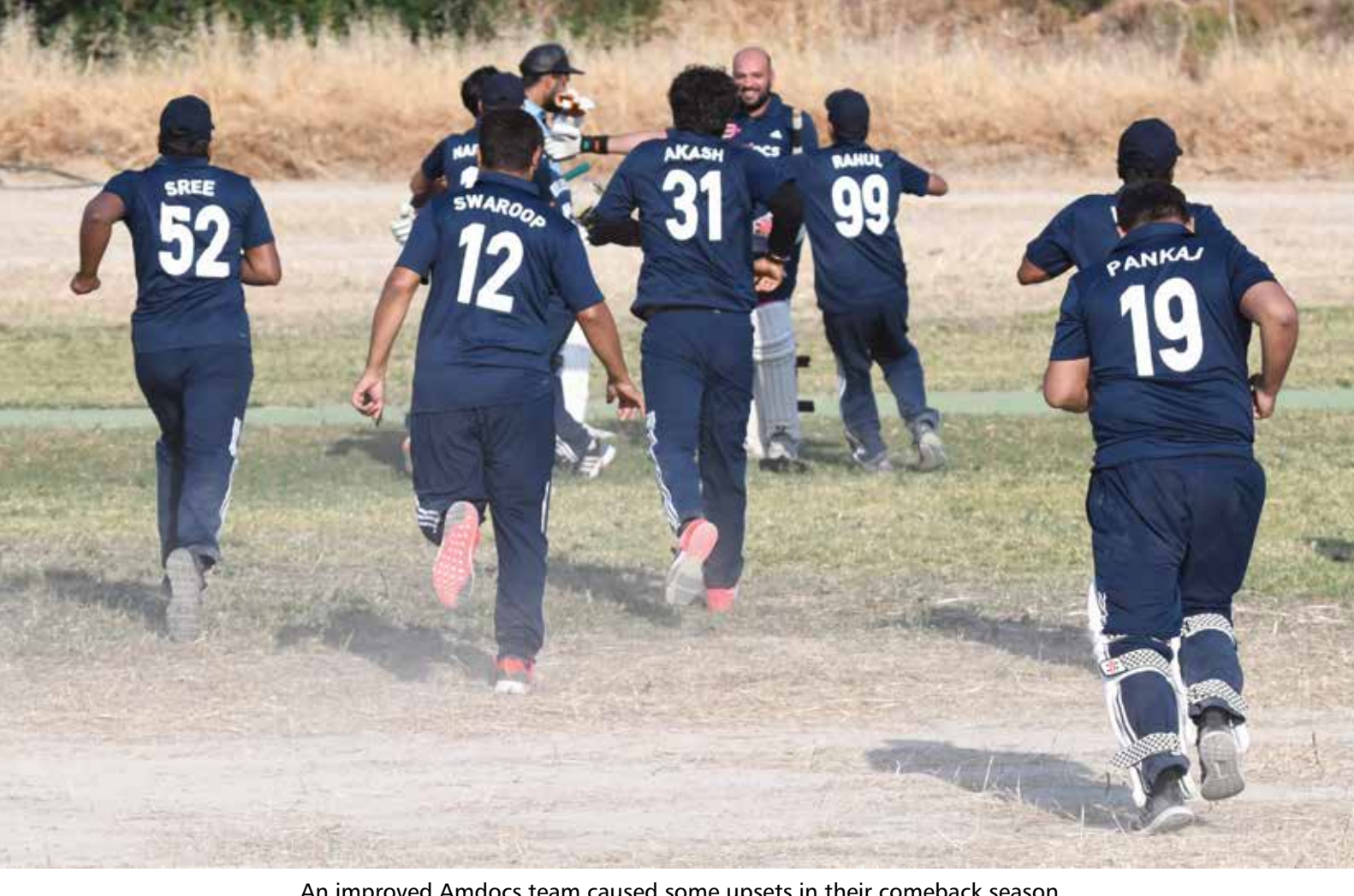
An improved Amdocs team caused some upsets in their comeback season

the score got closer to the target the tension mounted and the large crowd of mainly Sri Lankan supporters became more and more excited. The last Mustangs wicket fell with the score on 222 leaving Sri Lankans the winners by just two runs amid jubilant scenes.