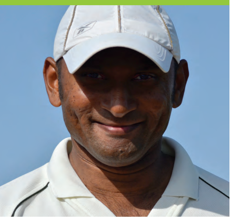
A Cyprus Cricket regular for 13 years and still going strong

AP: I hope you don't mind me mentioning that you're not the youngest player in Fellows, but watching you play, you're incredibly fit and still bowling and batting