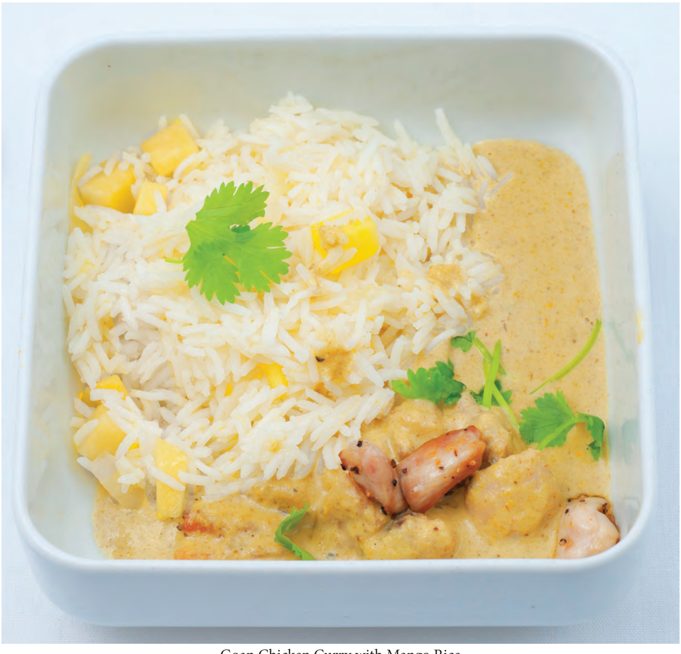
Goan Chicken Curry with Mango Rice