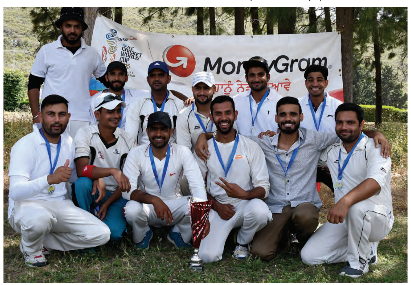
Nicosia Thunder - Spring T20 Winners

In the Spring league the eastern group was the stronger one, featuring the previous year's winners of T20, Mustangs, and 40-over champions, Sri Lankans, together with Nicosia Tigers, PWRR Dhekelia, and new team Nicosia Thunder, formed partly from previous Kazepis and Fellows players.