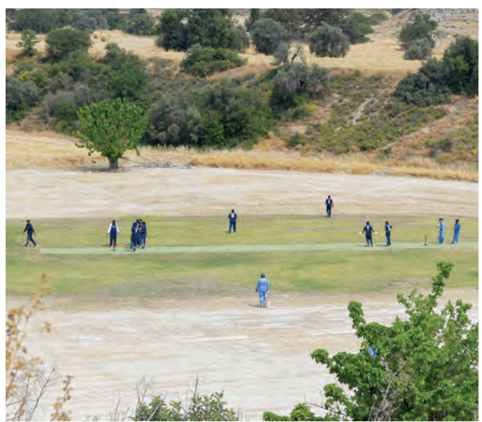
Amdocs vs Mustangs - the second game played at Tochni

The ground is still far from complete - as CCA Chairman Muhammad Husain said, "It's not Lord's, but one day it will be!". The outfield is largely clear of stones and weeds, but also of grass. The square is grassed and the CCA plan to expand the grassed area to cover the whole ground as money allows. Although the ground is essentially brand new, there