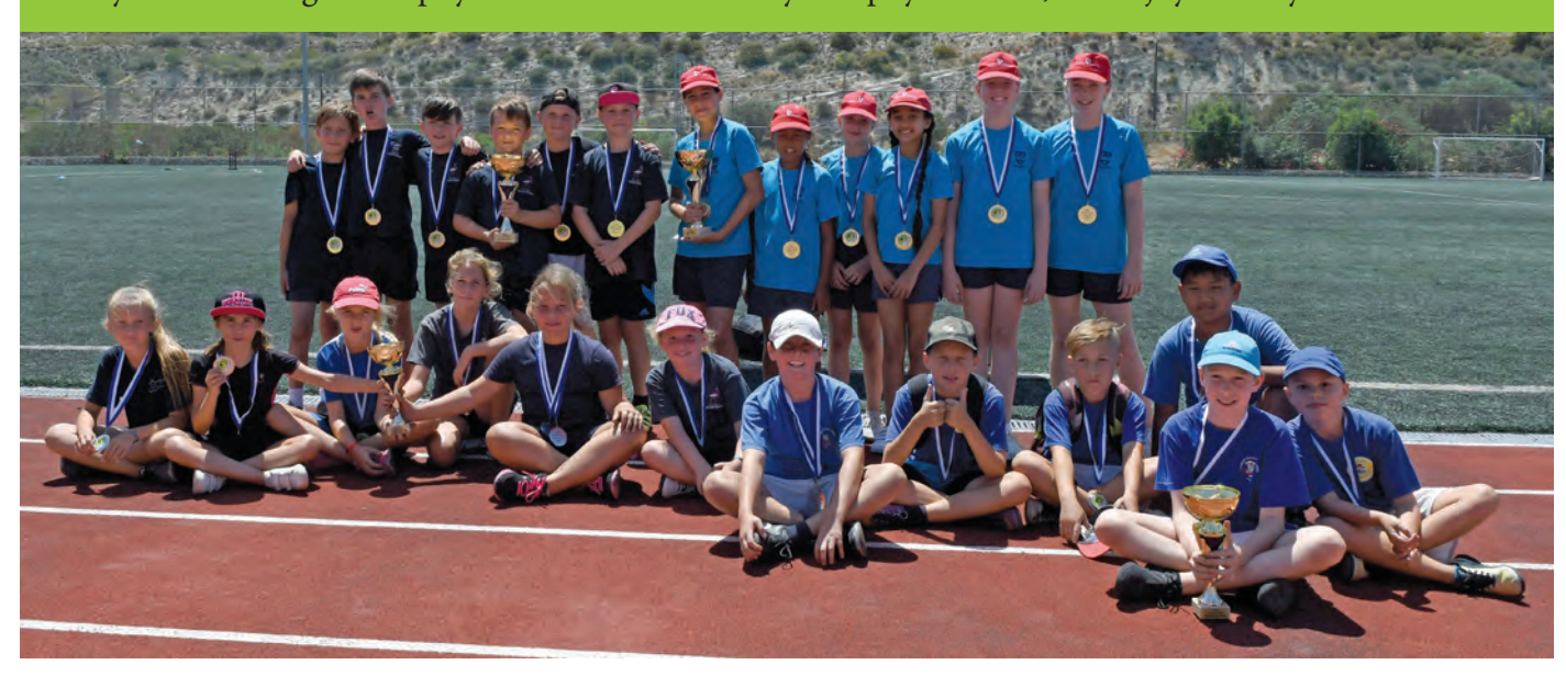
2018 Winners and Runners Up

Foleys A won the girls' trophy and Akrotiri A the boys' trophy on a hot, but enjoyable day.