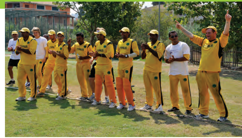
Cyprus celebrating victory over Malta during their last Euro Championships in 2012

all men's Twenty 20 games played between member sides after January 1st 2019 will be classified as full internationals.