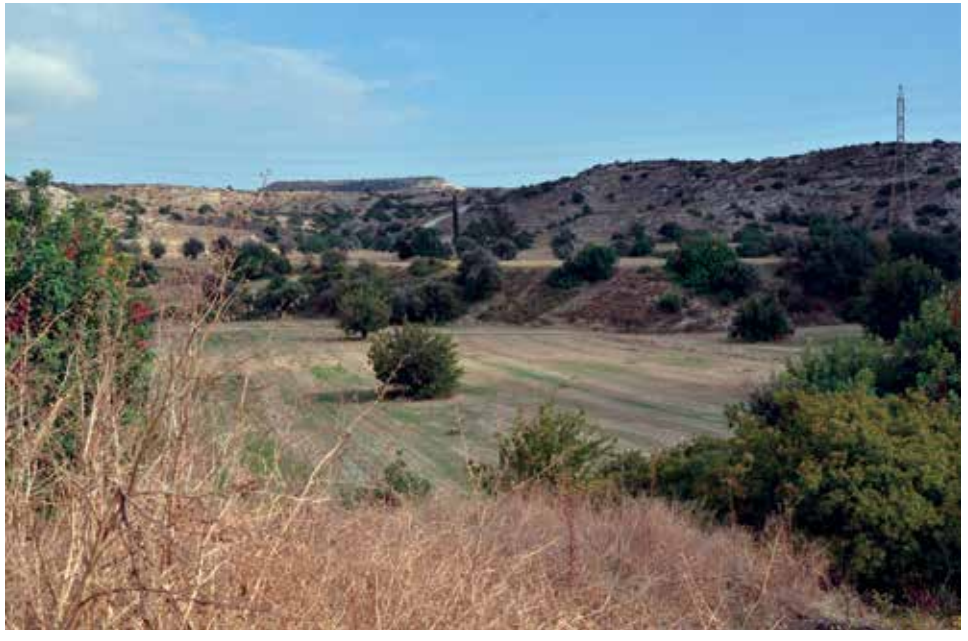
The field at Tochni before work started - as you can see, the ground is reasonably flat