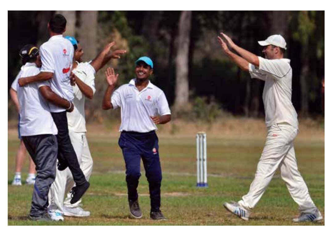
Moufflons vs Kazepis, 18 October - Moufflons celebrate a wicket

We were able to provide better records and statistical information on our