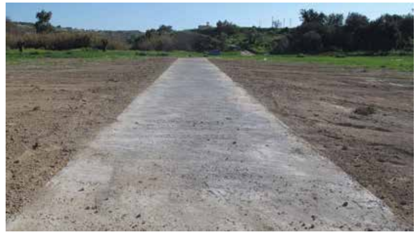
It's looking more like a cricket ground as the concrete wickets are now down.

The work started on the playing area in December 2015 for the facility to be utilized for domestic league games in the 2016 season.