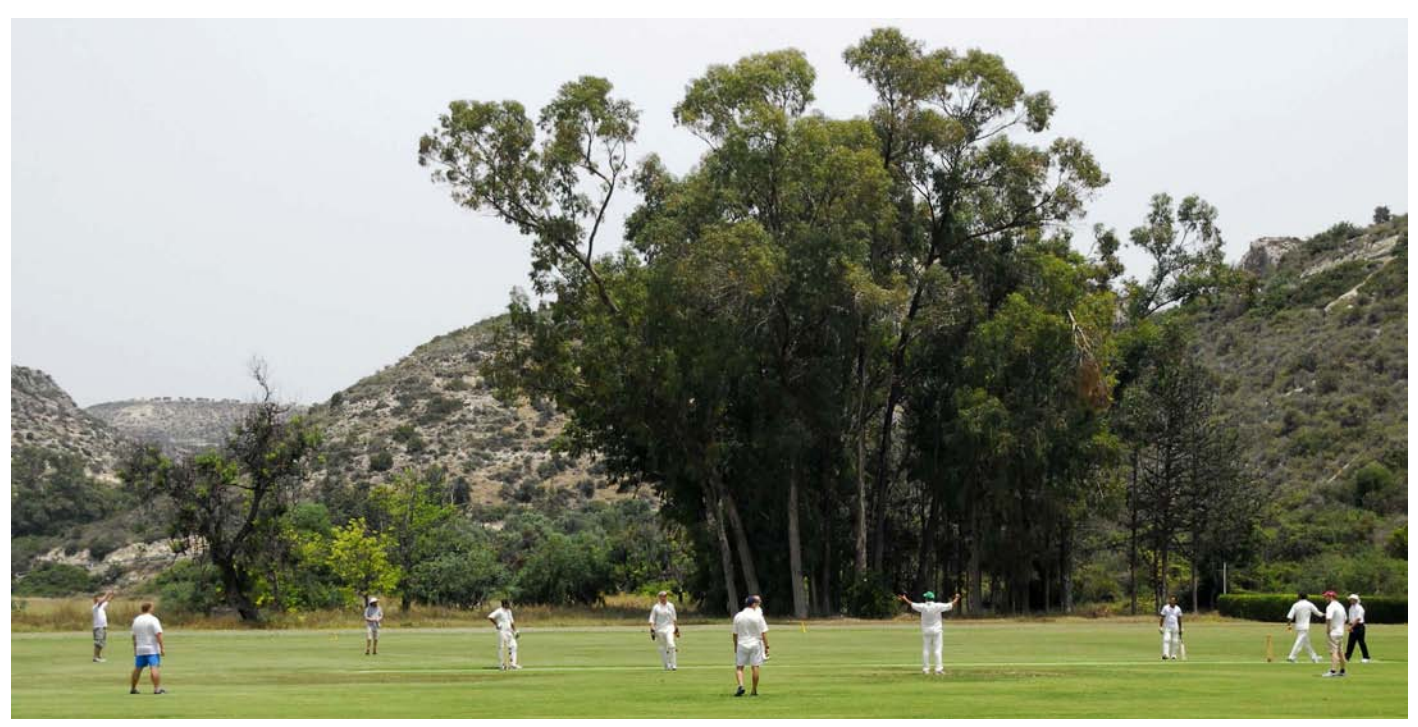
Moufflons in the field and appealing (unsuccessfully) vs Episcopi at Happy Valley

Moufflons players were mainly from the UK, with a sprinkling of expats from other cricket playing nations. Although, most were employed by international companies in shipping, finance and IT, there were also a few retired players.