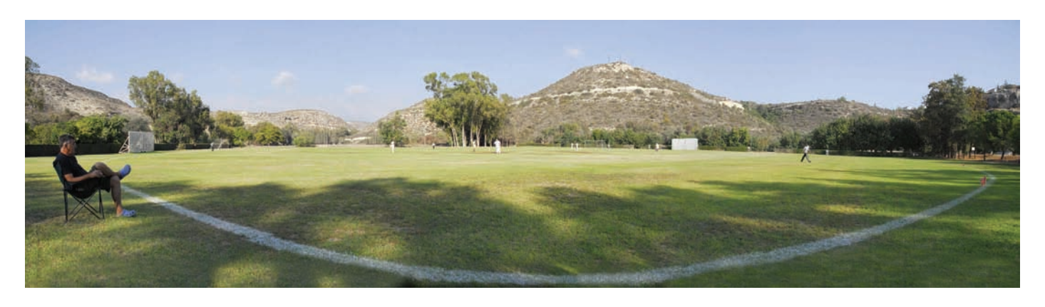
A Perfect Sunday - Watching the Cricket at Happy Valley

The Newsletter of the Cyprus Cricket Association www.cypruscricket.com twitter.com/cypruscricket