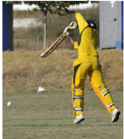
Arm in front of the face, nice portaloo in background

Usually I try and get the batsman's face into a picture and it turns out that that simple aim is ridiculously difficult. The helmet's peak often puts the face into