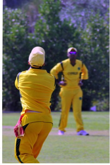
The fielder just caught the ball but as he's facing away from me, no-one would know.

the ball and I have to try and spot where the ball's heading and pick the fielder who's going to (try and) catch the ball, focus and zoom to reframe the shot. The problem is doing all this before the ball is caught. In fact, that's just one problem – other players and umpires can block the shot, the background might be distracting, if the ball is travelling too fast then it may not be visible. To summarise, if