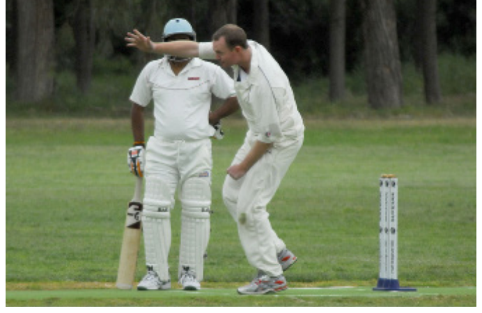
The bowler as a day old giraffe - note the arm across the batter's face

When I photograph a bowler, I take a burst of images as the bowler delivers the ball. In most shots, the bowler looks like a day old giraffe, with arms and legs everywhere, apart from one (or perhaps two) where he'll look graceful – and then there's a fair chance that his arm is right in front of his face. It might take 3 or 4 "bursts" – around 20 pictures – to get one where the bowler looks good, the background isn't too distracting, the ball is visible and there's no-one standing in the way.