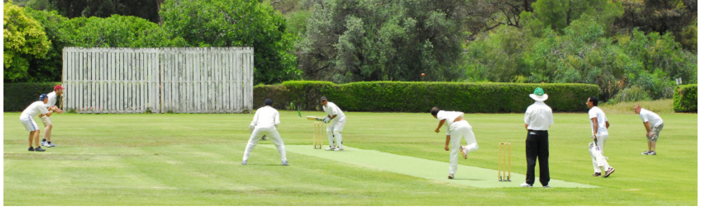
Episcopi vs Moufflons at Happy Valley, March 2013